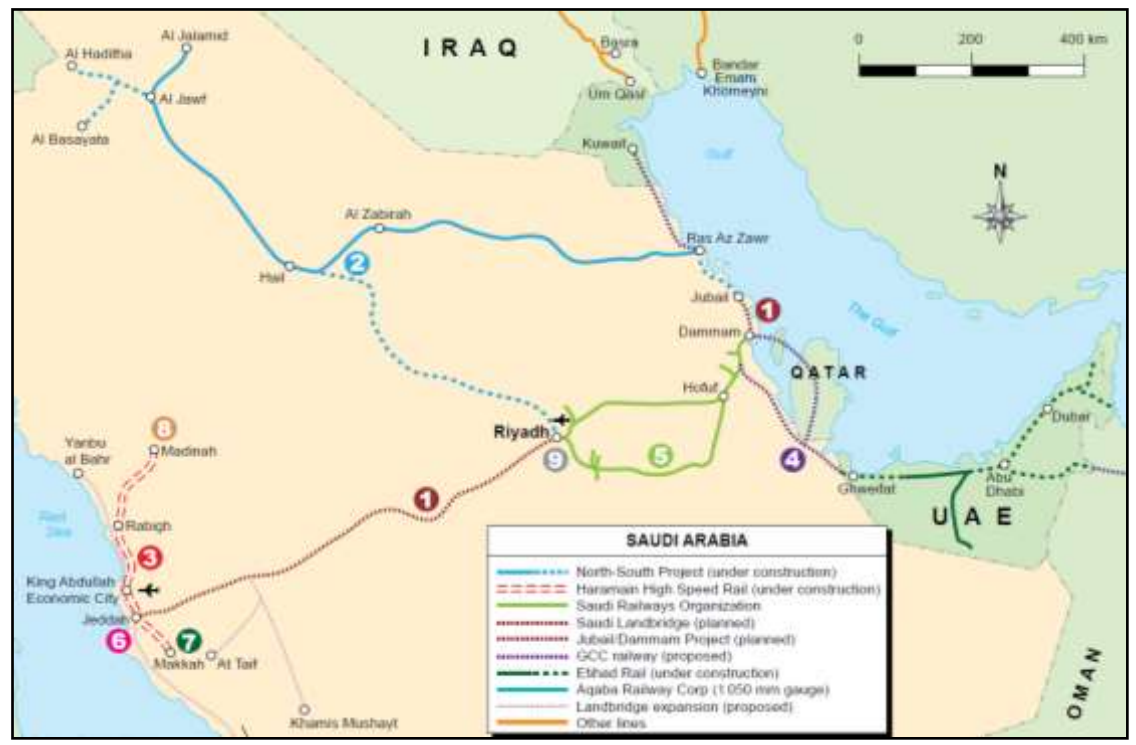
Figure 1: The five railway projects by Saudi Railways Organization

Railway networks as is known all over the world are effective in moving large volumes of bulk commodities over long distances and according to regular schedules and when compared to other means of transport can often be cheaper. In addition, there is heavy passenger movement on along between the Holy Cities between Makkah, Madinah with the big commercial traffic. Furthermore, they are safe and efficient in use of fuel and are responsible for less environmental pollution than some other forms of transport. The Saudi Arabia government has long had an ambition to expand its rather modest railway, which currently links Riyadh via two railway lines to the port of Dammam. There are five big projects planned by which the dream finally looks set to become a reality. The Supreme Economic Council has approved the implementation plans for five railway projects, which will be under the direction of the Saudi Railways Organization. The five railway projects are (Figure 1):